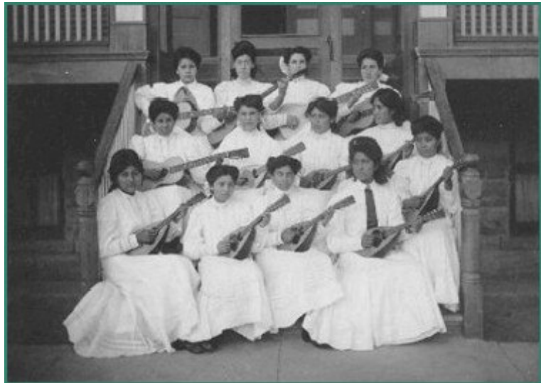
Grand Junction operated between 1886-1911. Grand Junction, CO